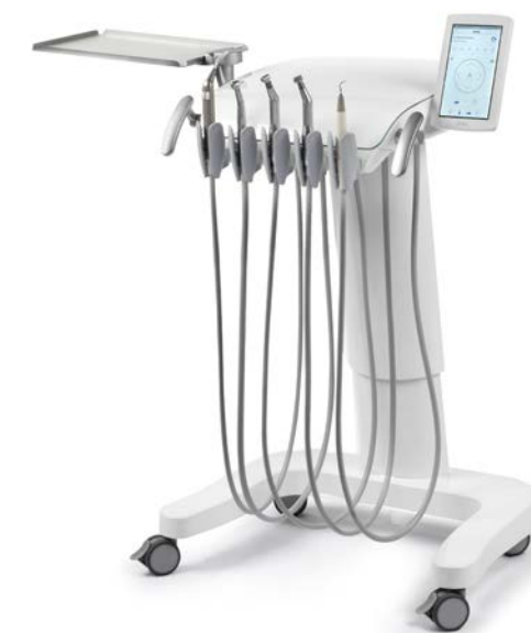
AUXILIARY TRAY for small hand instruments.