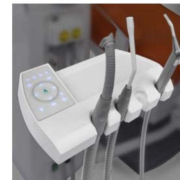
Standard removable and thermoisinfectable suction hoses.