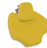
824 Soft Yellow Pistacho