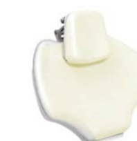
836 Soft Light Cream

Upholstery "Standard" and "Soft Plus" of high quality and very hygienic, fireproof, great elasticity and pleasant touch. Very resistant, difficult to rip.