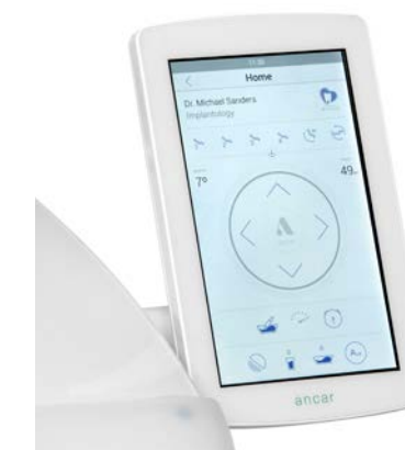
NEW TOUCH SCREEN