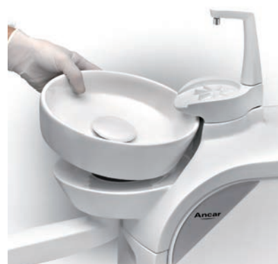
PORCELAIN CUSPIDOR CUP