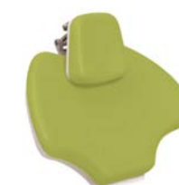
832 Soft Lime Green