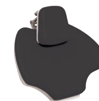
435 Pearl Black