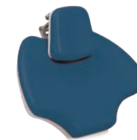
470 Dark Blue