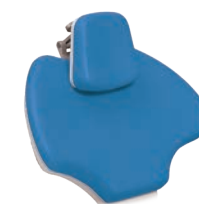
410 Pastel Blue