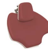
821 Soft Red Marsala