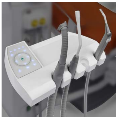
SYRINGE 6F. INOX installed as standard.