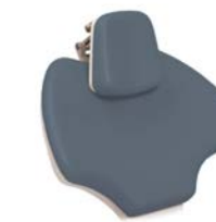
825 Soft Anthracite