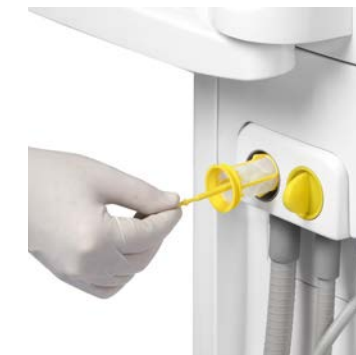
Easy cleaning suction filter.