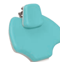
440 Pastel Green