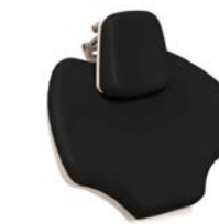
829 Soft Black