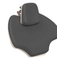
820 Soft Slate Grey