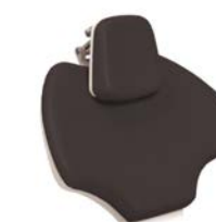
834 Soft Brown