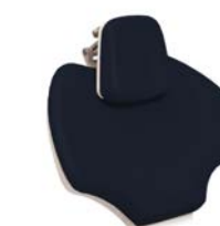
835 Soft Navy Blue