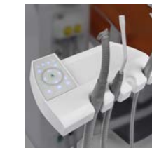
Optional "H1" system for the disinfection of suction hoses.

Optional "WEK" system to decontaminate water in the instrument hoses.