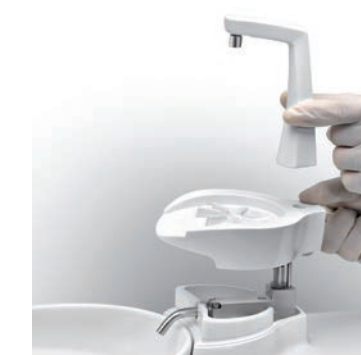
Removable cup tap for easy cleaning.