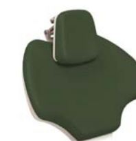
833 Soft Olive Green