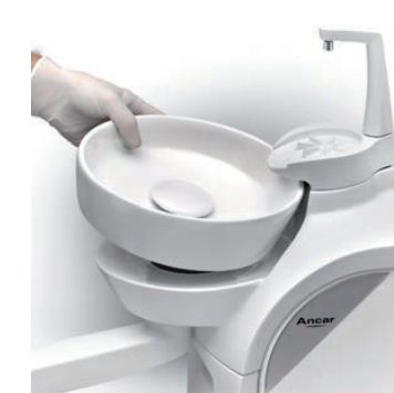
Removable and autoclavable cuspidor cup (at 135 degrees Celsius).