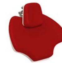
831 Soft Red