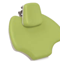
445 Pearl Green