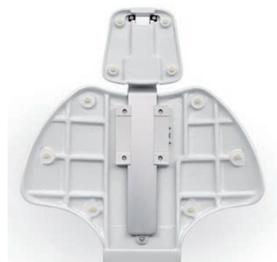
ALUMINUM CORE Unit, PATIENT CHAIR and pedal made of light alloy anticorrosive ALUMINIUM.