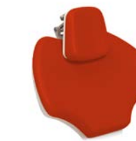
830 Soft Orange