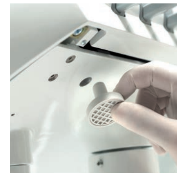
Oil recovery of the rotary instruments.