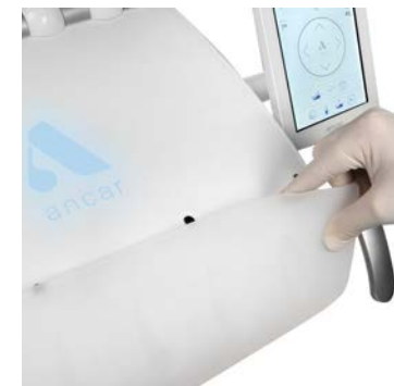
Removable and autoclavable silicone instrument holder.

Easy cleaning and impeccable hygiene in the dental clinic is our mission. We know that wasting time disinfecting some parts after each consultation can be time consuming. That's why our equipment is designed to make your life easier.