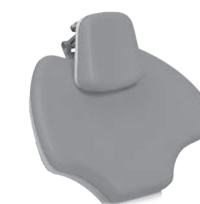
425 Silver Grey